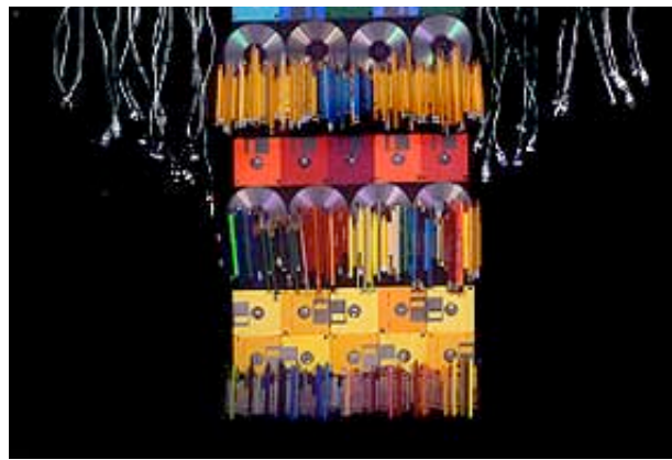
"Recording Memory Totem," painted wood, floppy disks, hard drives, pencils, USB cords and other writing tools.