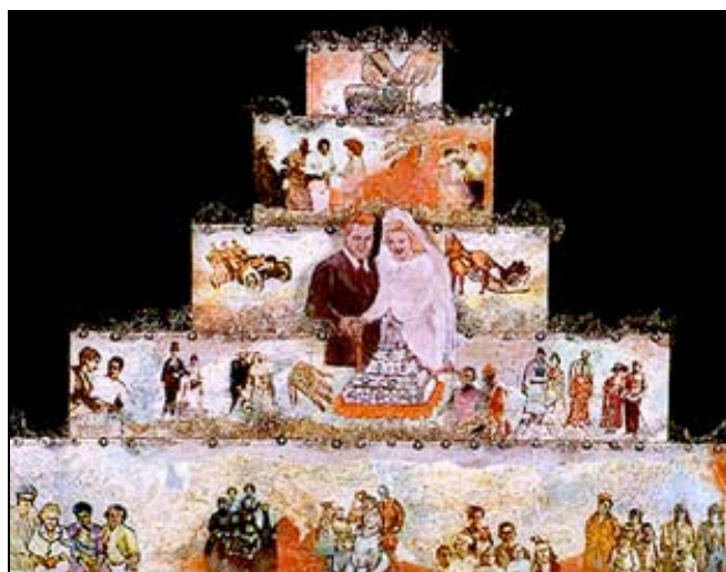
"One Family," found objects, digital photographs on old maps and crocheted wire on painted wood.