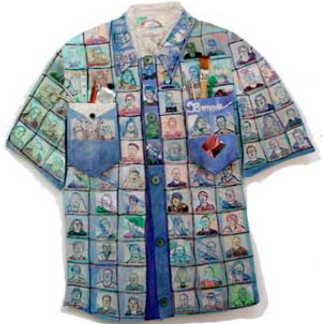
"Work Shirt," digital photography printed on maps and found objects on painted wood.

"I like to let the serendipity happen," she said. "Sometimes the mind's eye fools me and I have to redo a part, but more often than not I plan things out using my best apprentice in my studio – my computer."