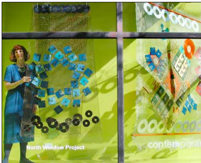
"Liberty on the Edge" (left), "Memory Quilt 1."

when she noticed the company name showing up along the edge. Every six inches was the word "Liberty." The title of the piece became "Liberty on the Edge."