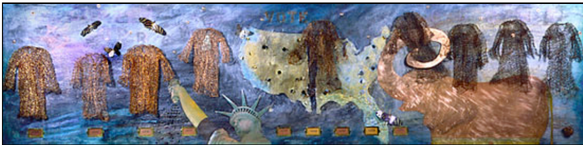
"2000 Supreme Court: Torn, Tattered & Tarnished," collage, crocheted wire, found objects, metal on painted wood.

"I can shrink the resulting plan and place it in a photo of the room," she said. "I can enlarge the drawing, make a template for construction, then take the template to the client so they can see how it fits in the real room."