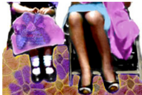
"Golden Hands," manipulated photography.

"The caring treatment I received as a student has shaped me as a teacher."